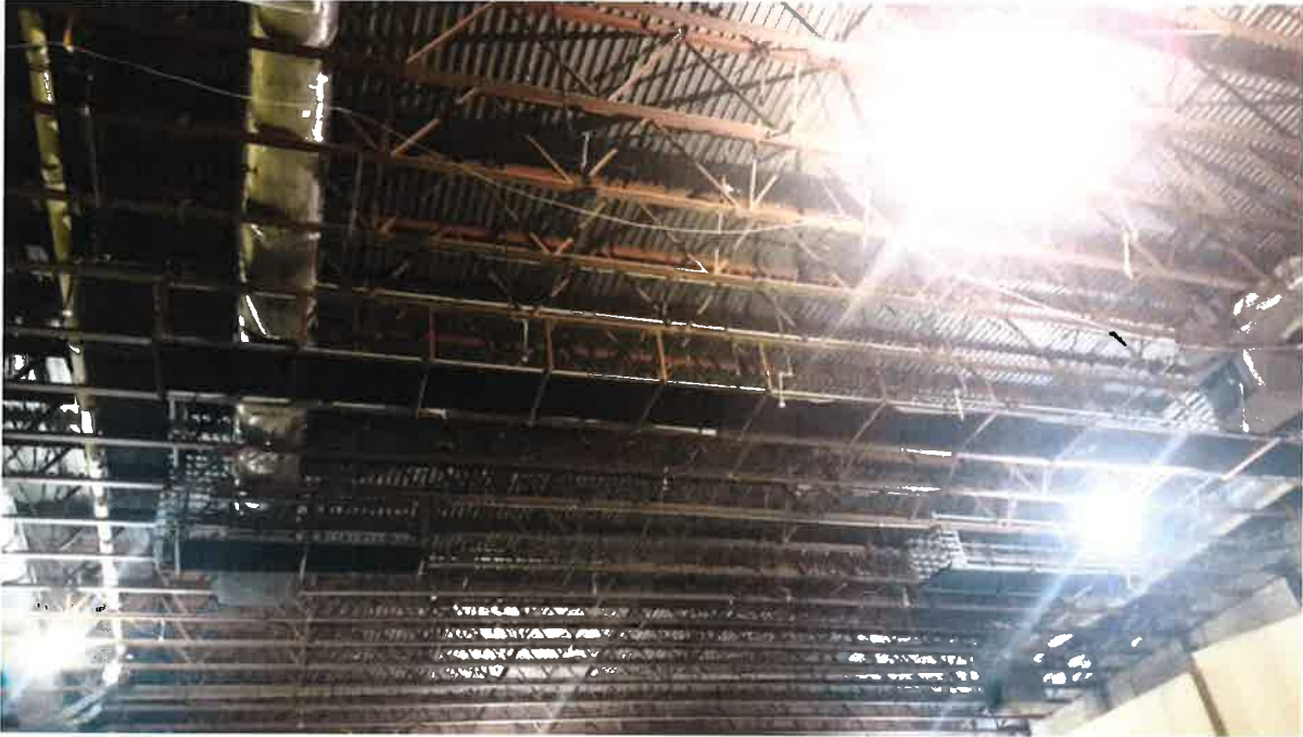
Auditorium Ceiling and Catwalk