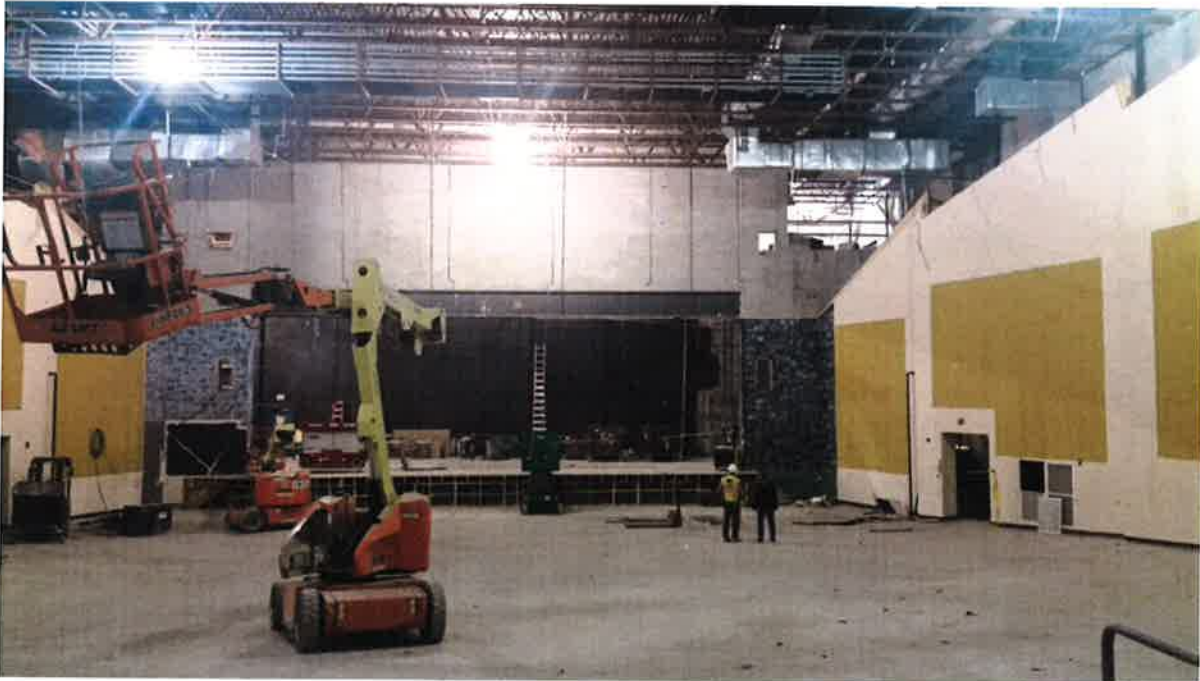
Auditorium Stage, from Rear