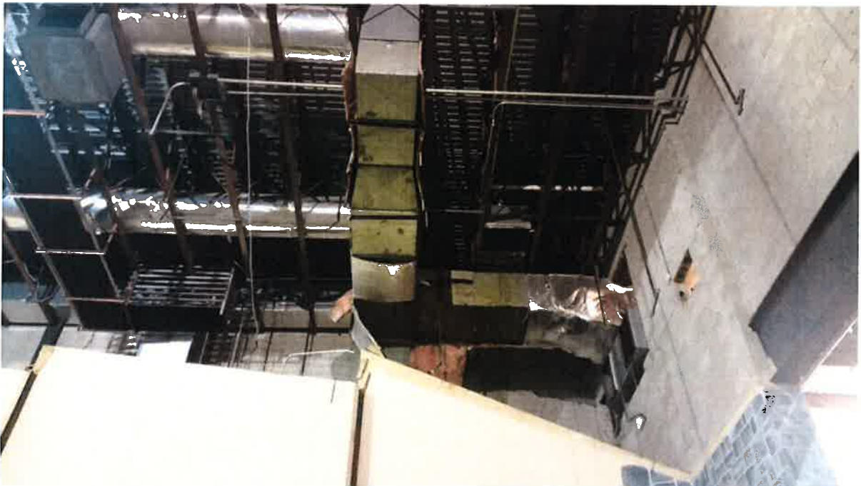
Existing Supply Ductwork Remains; Air Handling Unit Removed