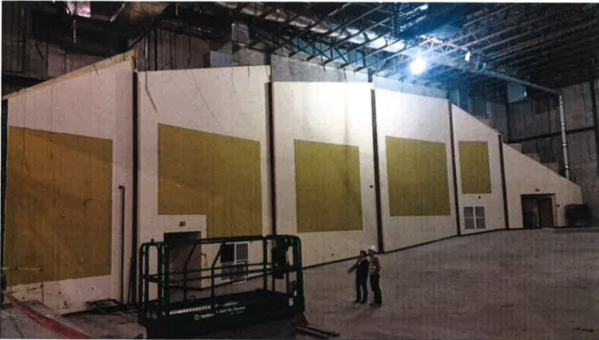
Auditorium, House Right