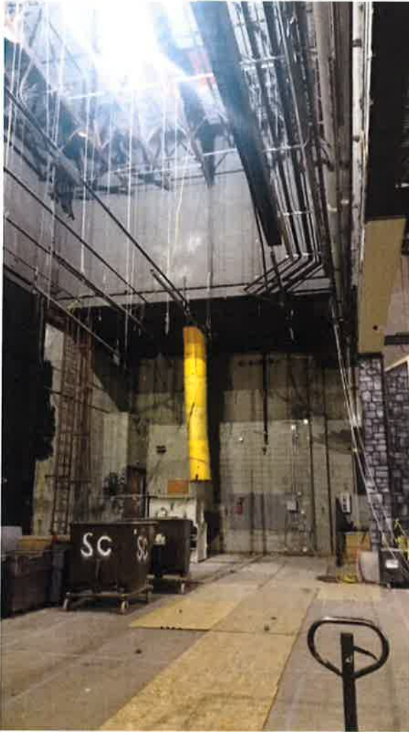
Demolition Progress, Stage Left