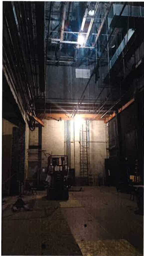
Demolition Progress, Stage Right