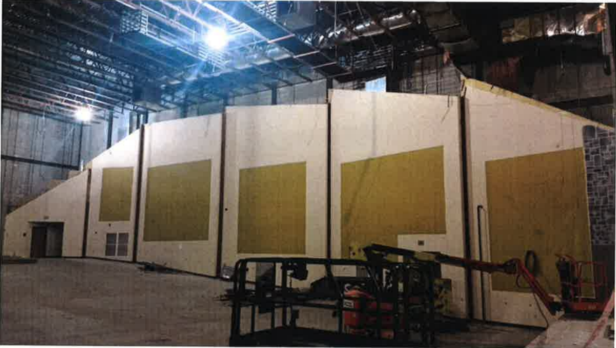
Auditorium, House Left