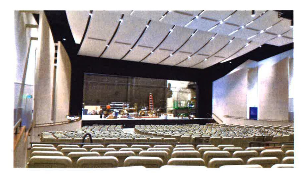
Newtown High School Auditorium