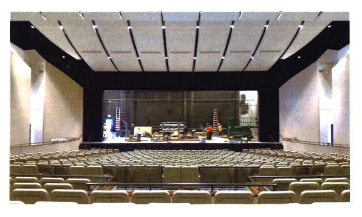
View of House and Stage from Control Booth (9/8/2017)