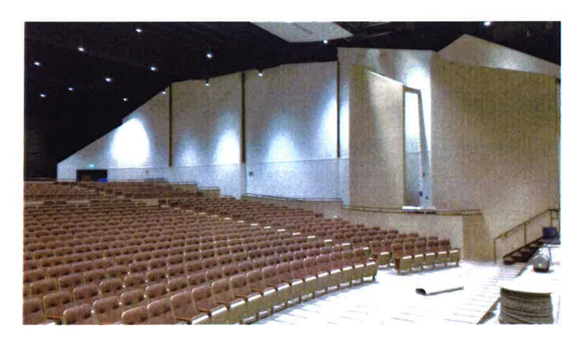
View of House from Stage Left (9/8/2017)