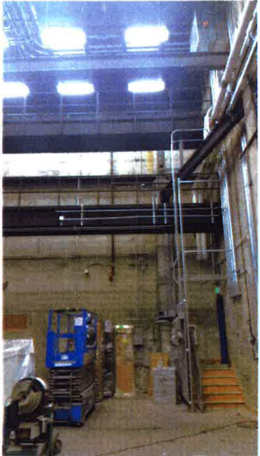
Side Aisle Behind Box Seats (9/8/2017)