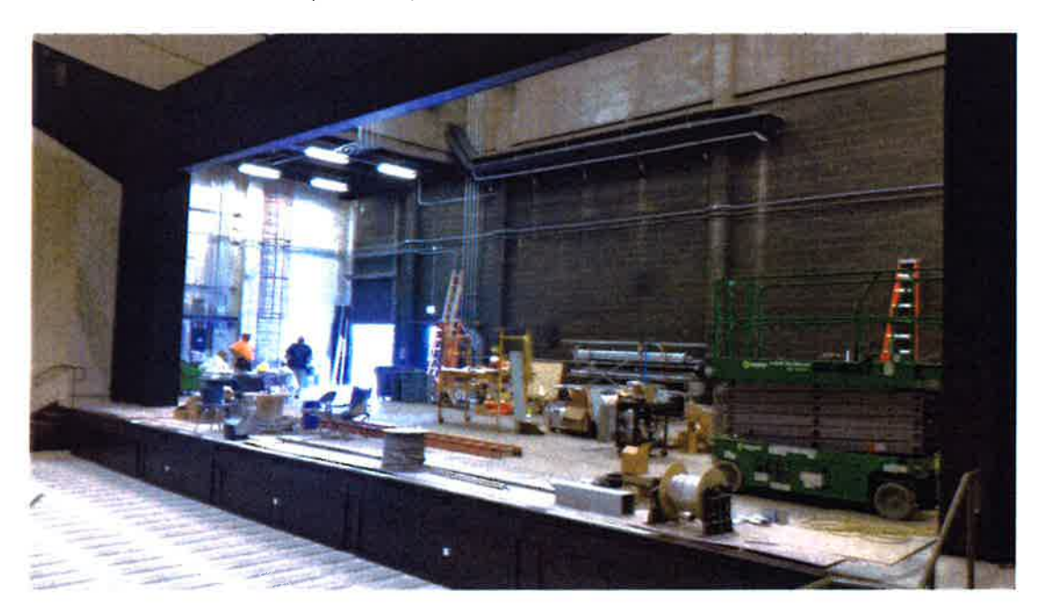
View of Stage From Box Seats, House Right (9/8/2017)