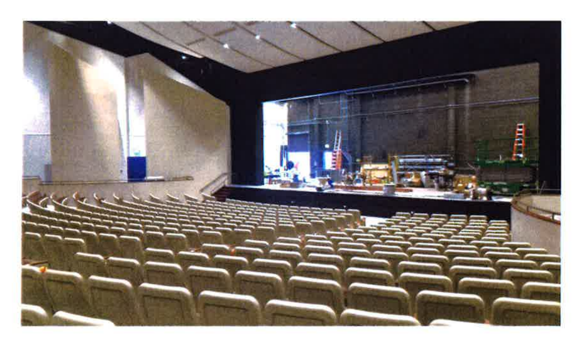
View of House from Raised Seating, Last Row, Right (9/8/2017)