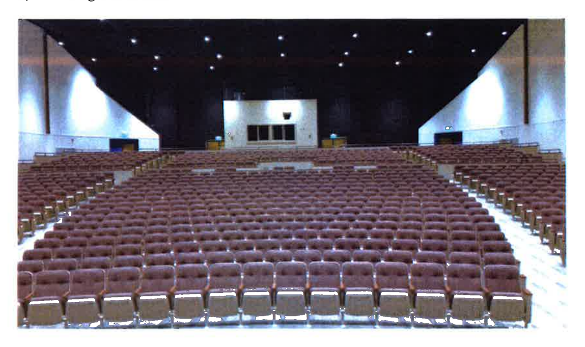
View of House from Stage (9/8/2017)